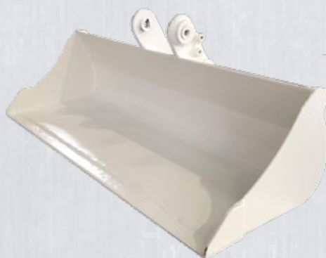
STRAIGHT BUCKETS 400 mm (10") AND 700 mm (28")